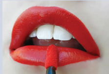
LIP COLOUR - LAYER 3