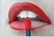
LIP COLOUR - LAYER 1